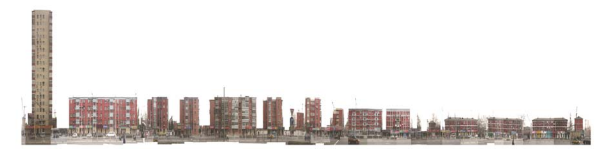
Figure 2. Investigation for street façade status