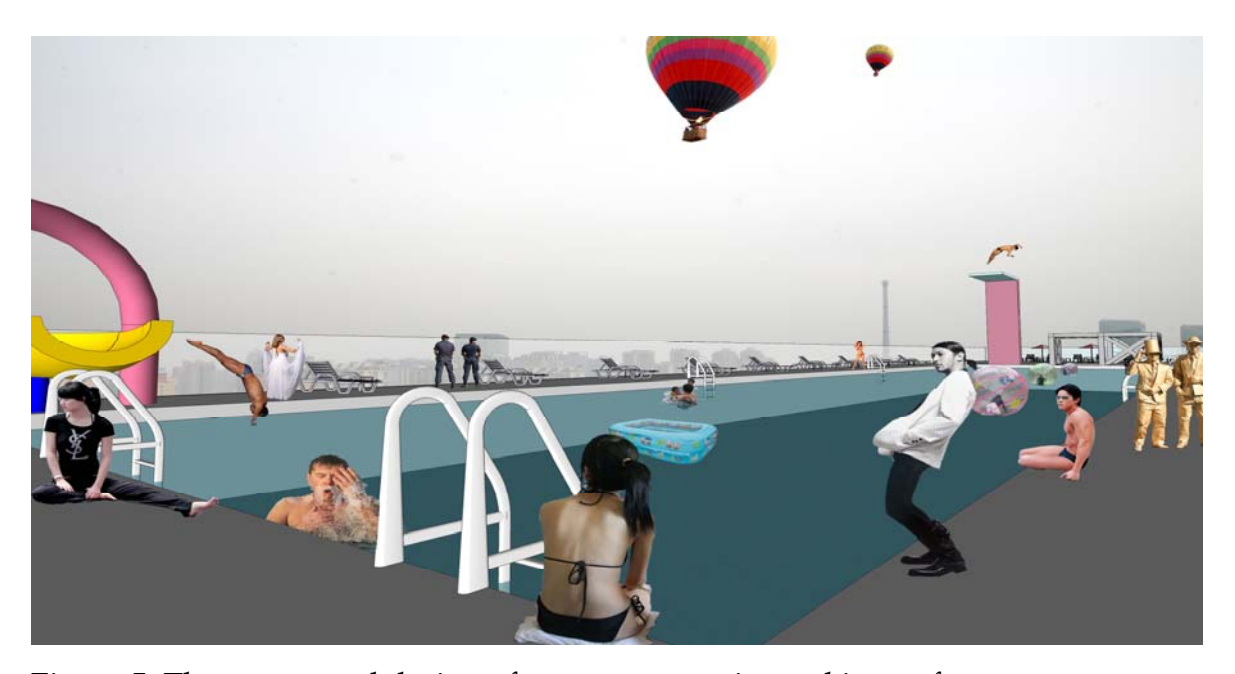
Figure 5. The conceptual design of trans-community and its roof-top

Contrary to the CBD development plan submitted by SOM and other companies, Fei Che and CU OFFICE's 'Jin-street mode' proposes an opposite developing strategy that preserves the local culture and community, develops urban quarters sustainable through the cooperation of public capital, market business and local society. Through the research into the successful 'Social Street' developing