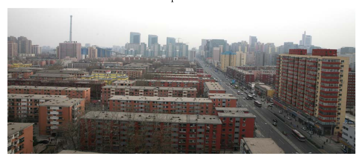
Figure 1. The photo of existing community, 2008

Fuzhen died in 29 November as a result of the injuries despite the treatment. The incident triggered great reactions among the public in China, and the criticism to the local authorities' and the real estate developer's combined violent demolition forced the central government to be involved in the investigation. The fact that the urban residents resort to the most extreme ways, namely using violence against themselves to protest the demolition, to fight against the demolition troops, drives people to reflect on the balance between the huge profit of the real estate industry and the rights of the civil society, and the urban development plan that over-relies on the demolition of the old cities to develop new ones.